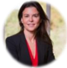
Ofra Strauss, Chairperson, Strauss Group

The new composition of the Chamber Board of Directors is as follows: