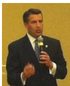
Brian Sandoval, Gov. of Nevada

The Chamber, together with the Federation of Israeli Chambers of Commerce, organized events and meetings last month with the governors of Texas and Nevada, Rick Perry and Brian Sandoval, respectively, who headed business delegations to Israel. U.S. Governor Rick Perry of Texas granted an interview to the Chamber, here . Additional meetings took place with trade representatives from Arizona and Cincinnati, OH. During these meetings, representatives presented the advantages for Israeli companies investing in their regions and met with local companies contemplating entry into the U.S.